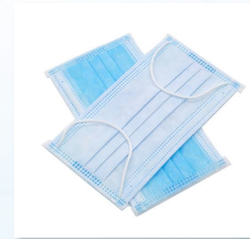
Surgeon Mask Loop