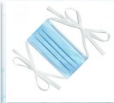
Surgeon Mask Tie